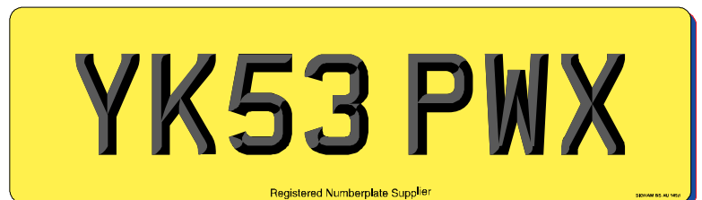
21" by 6" 3D Digits - 533mm by 153mm