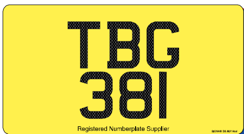
Import 13" by 7" M'Cycle Carbon Digits - 330mm by 178mm