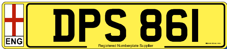
Standard Std Digits - English Flag - Inside Black border 520mm by 110mm