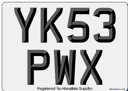
Square 285 by 203mm 3D Digits