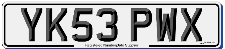
Standard 3D Digits - Black Border - 520mm by 110mm