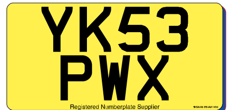
Import 12" by 6" M'Cycle Digits - 305mm by 152mm