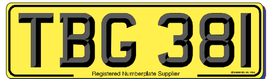
Short Standard 3D Digits - Black Border - 370mm by 110mm