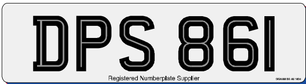
Medium Standard Hi-Line Digits - 420mm by 110mm