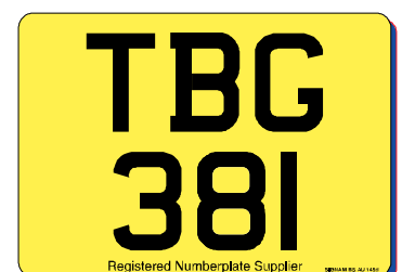
M'Cycle M'Cycle Digits 241mm by 171mm